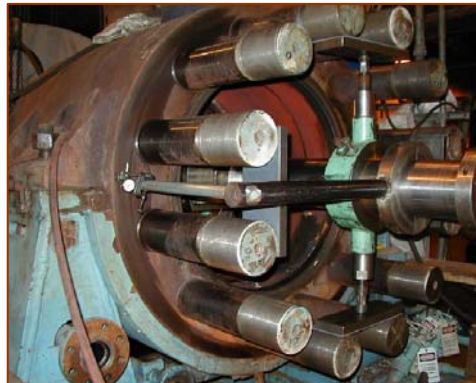
Barrel Field Machining