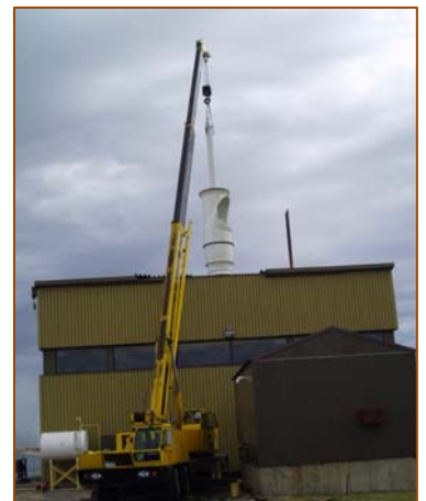
Installing Repaired Circulating Water Pump