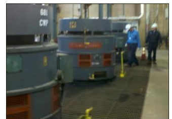
Once Through Circulating Water Pumps