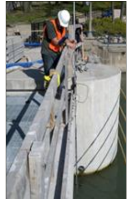
Measuring Velocities at Pump Intake Structure

Magnetic flow meters have no moving parts. They are more accurate, easier to use, and are not subject to debris issues as are other testing methods previously used.