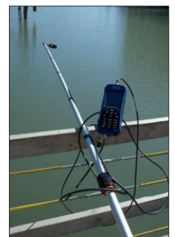
Magnetic Velocity Probe and Meter